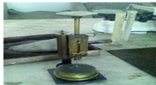
Fig. 2. VICAT apparatus

The standard consistency of a cement paste is defined as the one which permits the VICAT plunger to penetration to a point 5 to 7mm from the bottom of the mould when the given cement paste is tested.