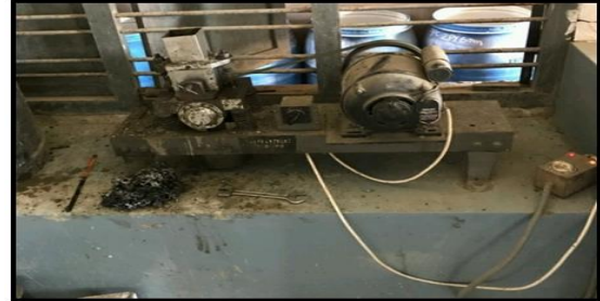
Fig. 7. Vibrating Machine

III will be added in 3 equal weights. The cementations materials were thoroughly mixed followed by gradual water. Mixing is prepared for each cube and put on the vibrating machine, after vibrating 3 minutes then ready the casting cube.