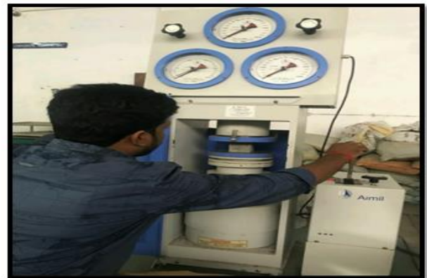
Fig. 11. Testing of specimens

days, and 28 days, 60 days and 90 days at regular intervals.