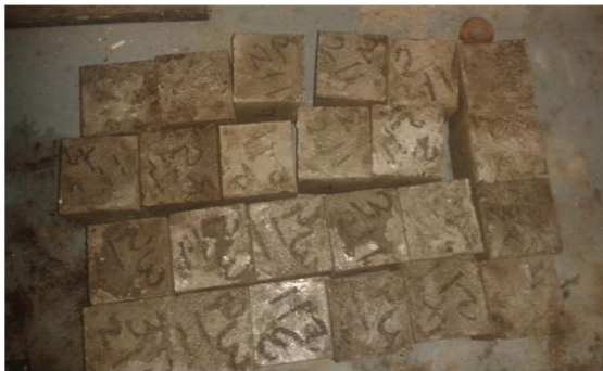
Fig. 9. Demoulded specimens