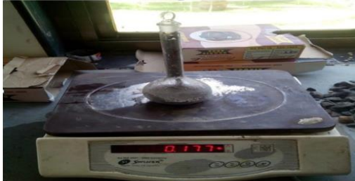
Fig. 3. Specific gravity bottle