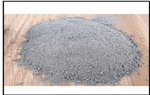
Fig. 4. OPC 53 grade