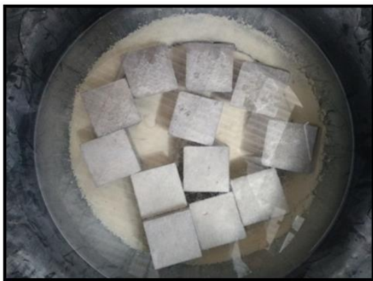
Fig. 10. Curing of specimens