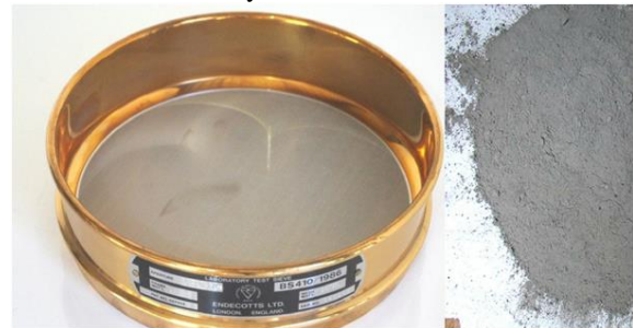
Fig. 1. Fineness of cement

The degree of fineness is a measure of the mean size of the grains the fineness cement as quicker action with water and gains early strength without change in its ultimate strength. Finer cement is susceptible to shrinkage and cracking. A correction factor is to be applied for fineness of cement as all sieves are not exactly alike.