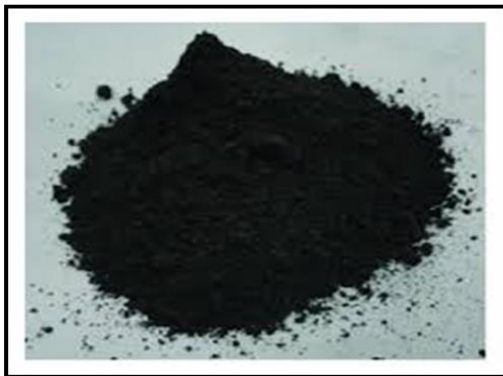
Fig. 6. POFA

Palm oil fuel ash (POFA) is freely available material. The chemical properties of palm oil fuel ash are obtained by testing the samples as per Indian standards.