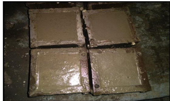
Fig. 8. Casted specimens

The test moulds is kept ready before preparing the mix. The cast iron moulds are cleaned of dust particles and applied with mineral oil on all side before concrete is poured into the moulds. The moulds are placed on the level platform. The specimen sizes are 70.7×70.7×70.7mm. The specimen is kept in the vibrating machine and filled with mix and then vibrated. Excess concrete is removed with a trowel and top surface is finished level and smooth as per IS 516-1959.