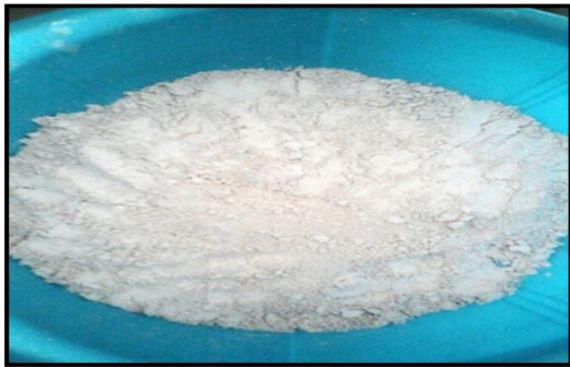
Fig. 5. GGBS

required is known to be ground granulated blast furnace slag (GGBS). The GGBS generation needs a tiny extra energy equated with the required energy for the portland cement production. This substitution of GGBS in place of port land cement will results in the mitigation of CO 2 emission. Hence this is a material that is friendly in nature. It can be utilized as a supplement material about to 80% of portland cement in concrete. High volume eco-friendly replacement of slag results in the production of concrete which not only utilizes the wastages from industries but also save substantial energy and natural resources. This in turn mitigates the cement consumption.